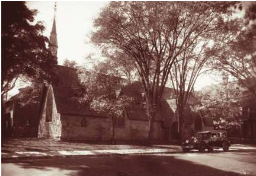
St Bart's - circa 1930